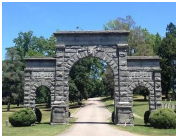
Blandford Cemetery Arch leading to Memorial Hill

“Planning for the Future while Honoring and Respecting the Past”