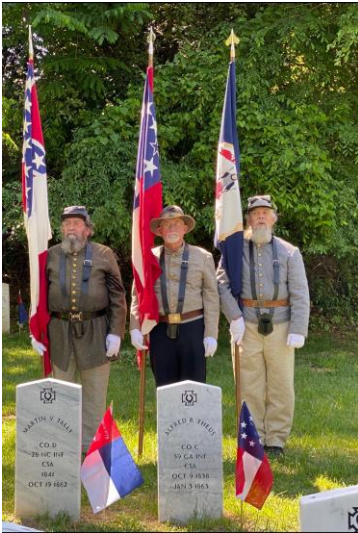
1st Corps Color Guard, Edmund Ruffin Camp #3000, SCV