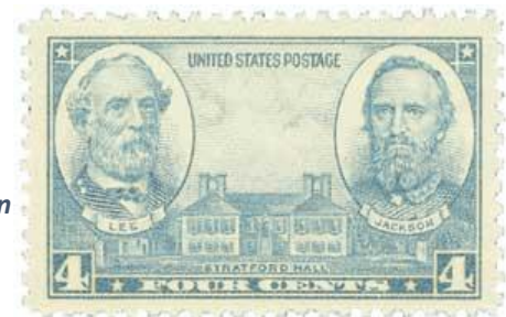
1937 U.S. Army & Navy Series: U.S. Army Heroes: Robert E. Lee & "Stonewall" Jackson with Stratford Hall in the middle