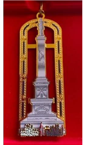
Mathews Court House Monument Ornament

May field trip is planned to Shockoe Hill Cemetery, St. Johns Church and Chimborazo in Richmond.