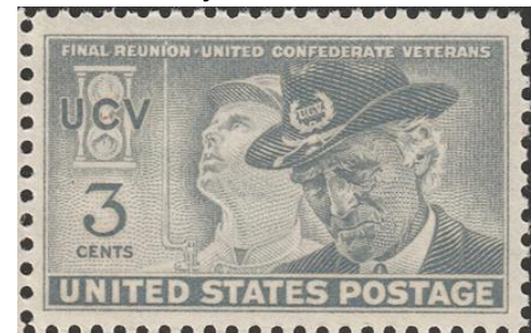
1951 U.S. Commemorative Stamp Recognizing the Final United Confederate Veterans' Reunion